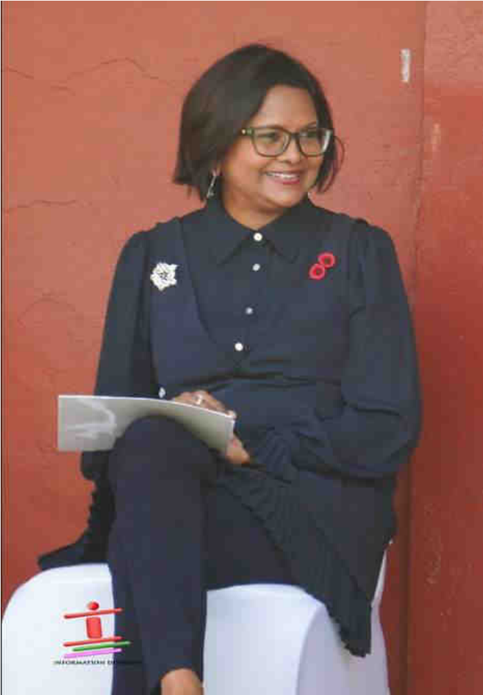
Mrs. Christine Kangaloo President of the Republic of Trinidad and Tobago

During President Christine Kangaloo's address at the opening of Parliament on May 23, 2025, she encouraged lawmakers to prioritize the enactment of comprehensive legislation protecting the rights of persons with disabilities. She highlighted the urgent need for laws that ensure individuals with disabilities have equal access to social, economic, and educational opportunities. "It is our collective responsibility to remove barriers that prevent full participation of all citizens," the President stated, emphasizing the importance of inclusivity in building a fair and just society. (guardian.co.tt)