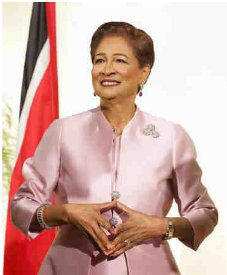
Mrs. Kamla Persad-Bissessar Prime Minister of the Republic of Trinidad and Tobago

“In addition to those 2,000 children that we have worked together to help, our Minister of Education, through the Ministry of Education, will be assisting 20,000 children with book grants. When we got into office, there was no provision in terms of money for book grants for children this year and one of the first things we did, we had something called a mid-term review. We had to find money and we sat together, we cut out some things that we felt were not essential because we believed that your